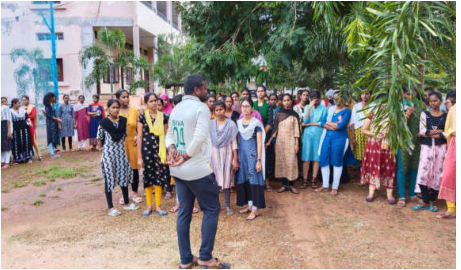
INTERACTION WITH PHYSICAL DIRECTOR