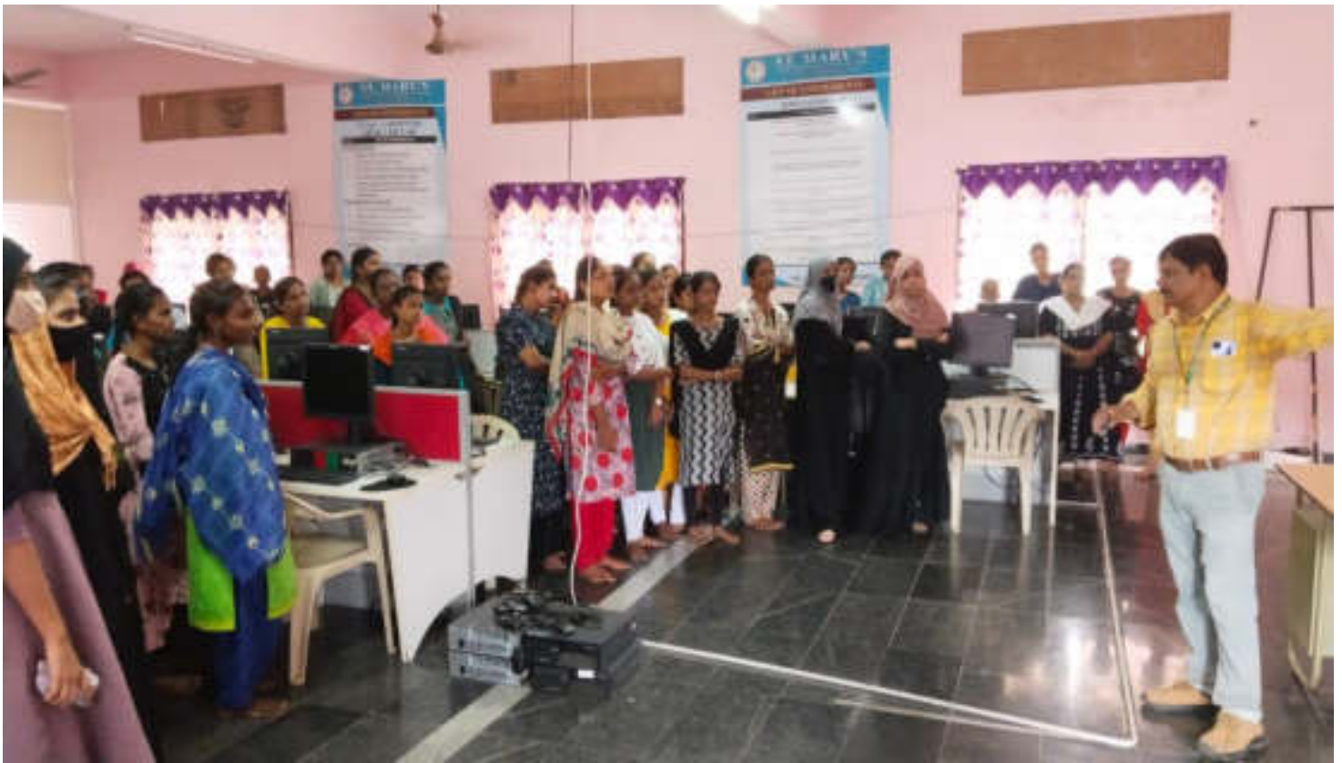
FACULTY INTERACTION IN COMMUNICATION LAB