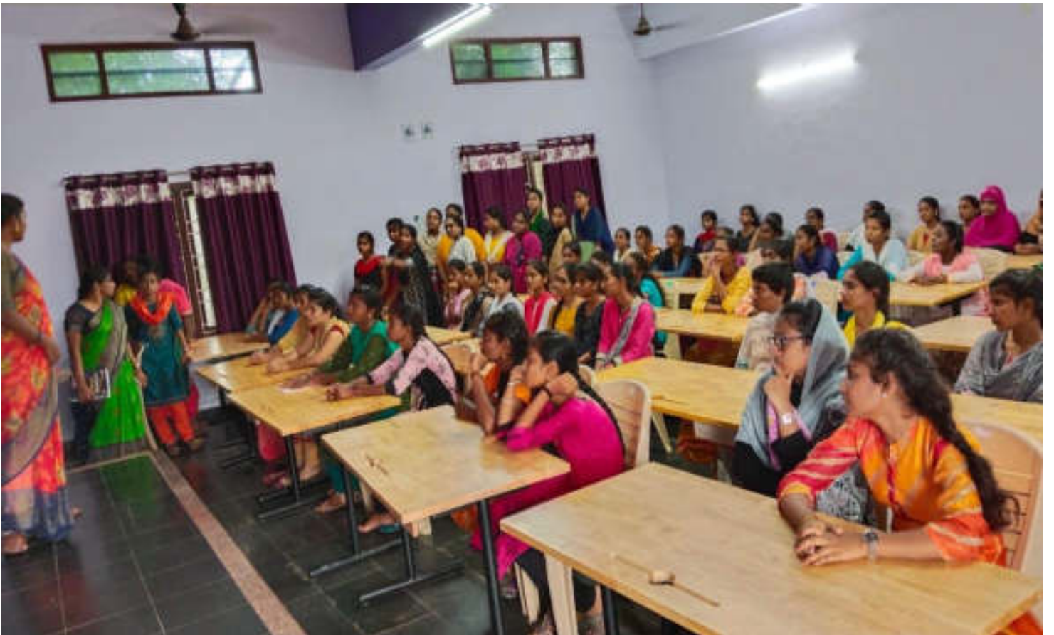
DIGITAL CLASS ROOM