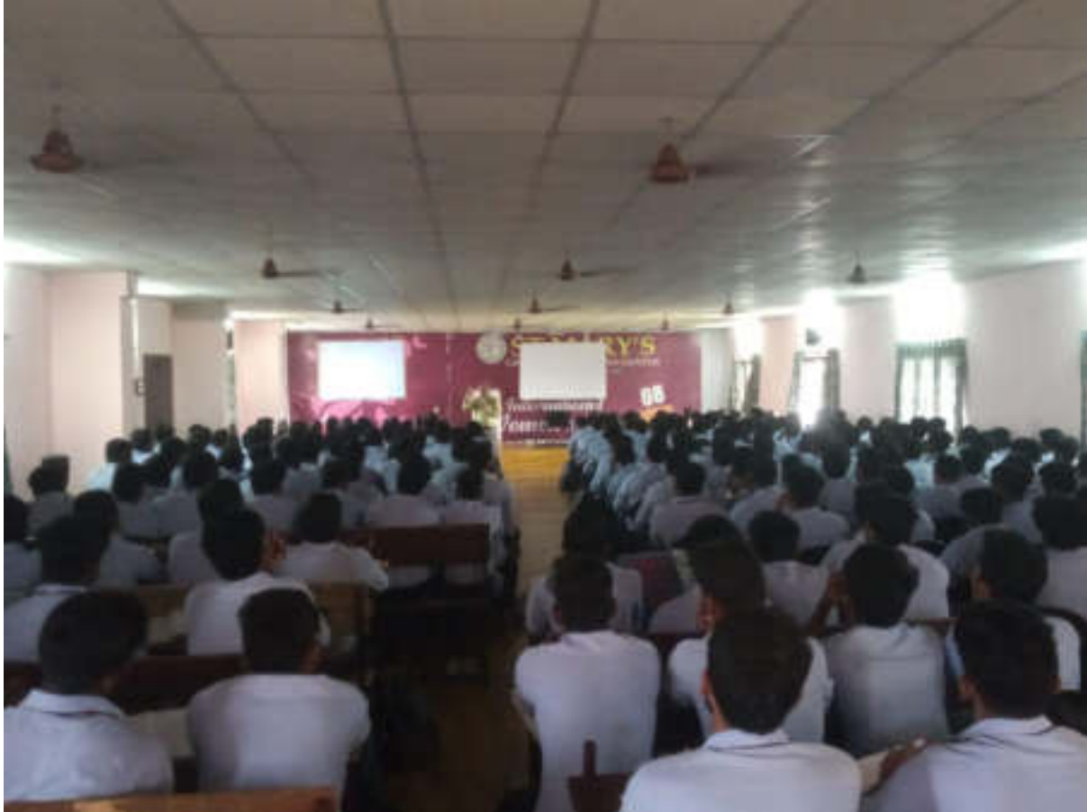
A Guest Lecture conducted for III CSE AIDS, AIML, DS, CS Students on the subject Java Programming by Dr.K Suresh Babu, HOD, AIML, VVIT Nambur, Guntur on 2 nd , January 2022 at F-Block Seminar Hall.

Phone : 08644-254477, 88, Mobile : 9030235630, 96667 77091, 99483 99402, 99514 28677, Fax : 040-66809093