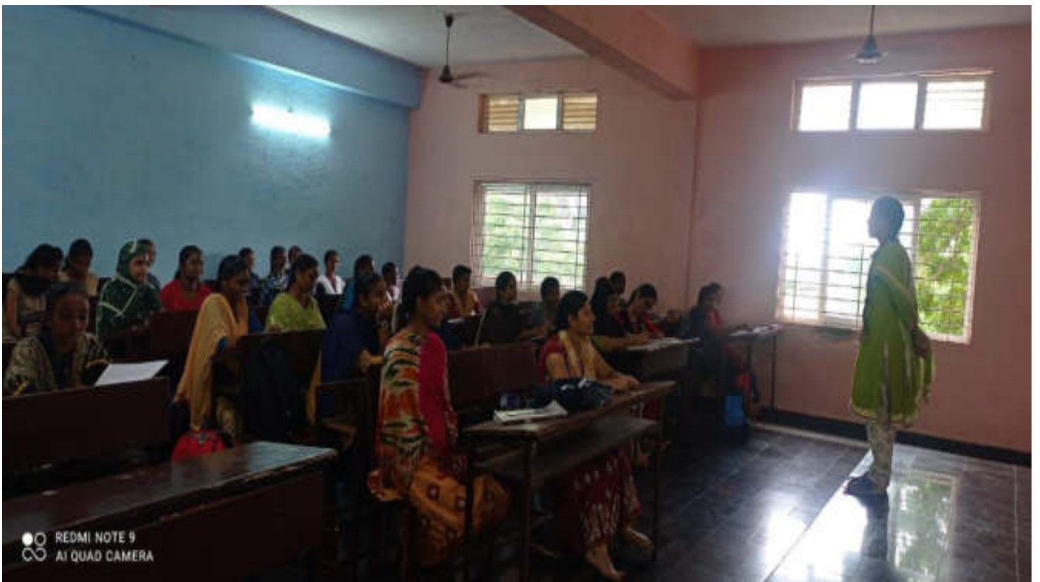
QUIZ COMPETITION (GK)