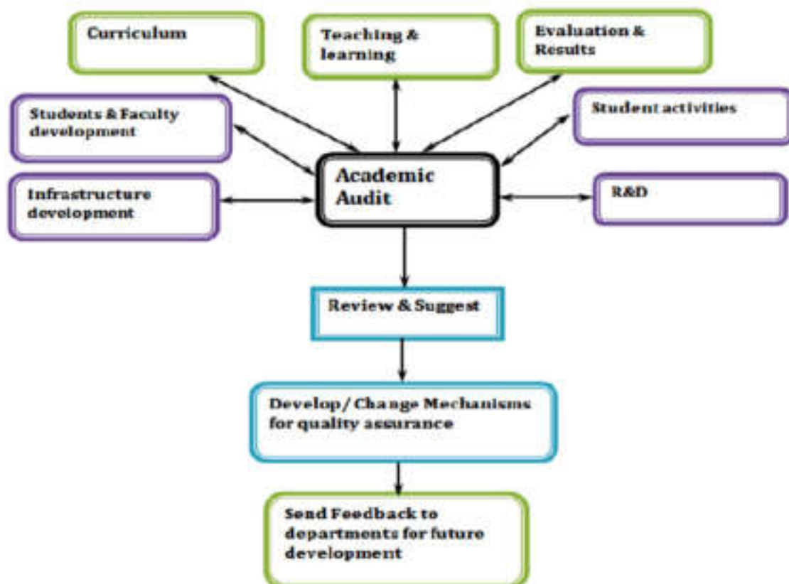
Figure: Department Level Academic Audit Process

These documents are updated regularly in the process of quality assurance. Appropriate suggestions for future development or continuous improvement are sent to the faculty members and students.