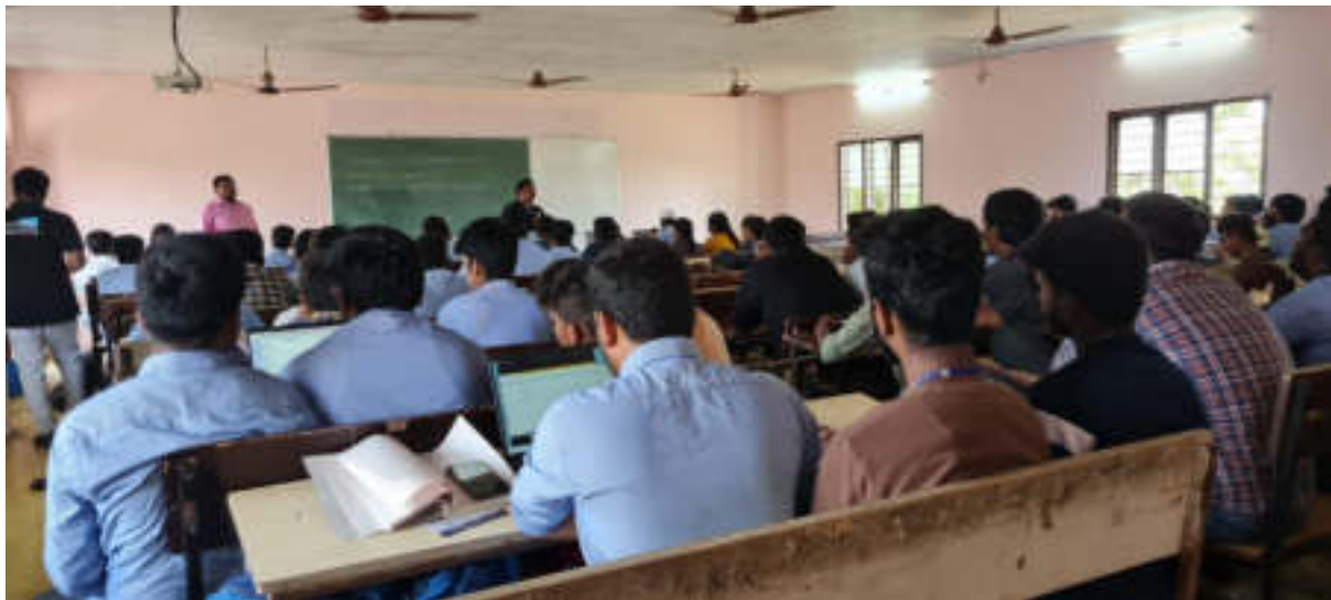
A One week workshop conducted II CSE Emerging Students on Mobile Application Development from 13-03-2022 to 17-03-2022 at F-block Digital Class Room.