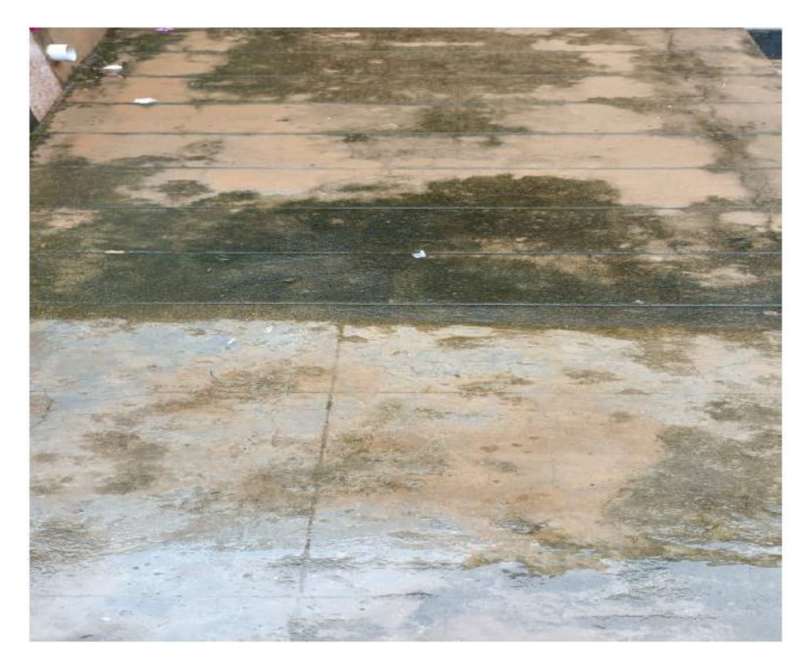
Block C and D